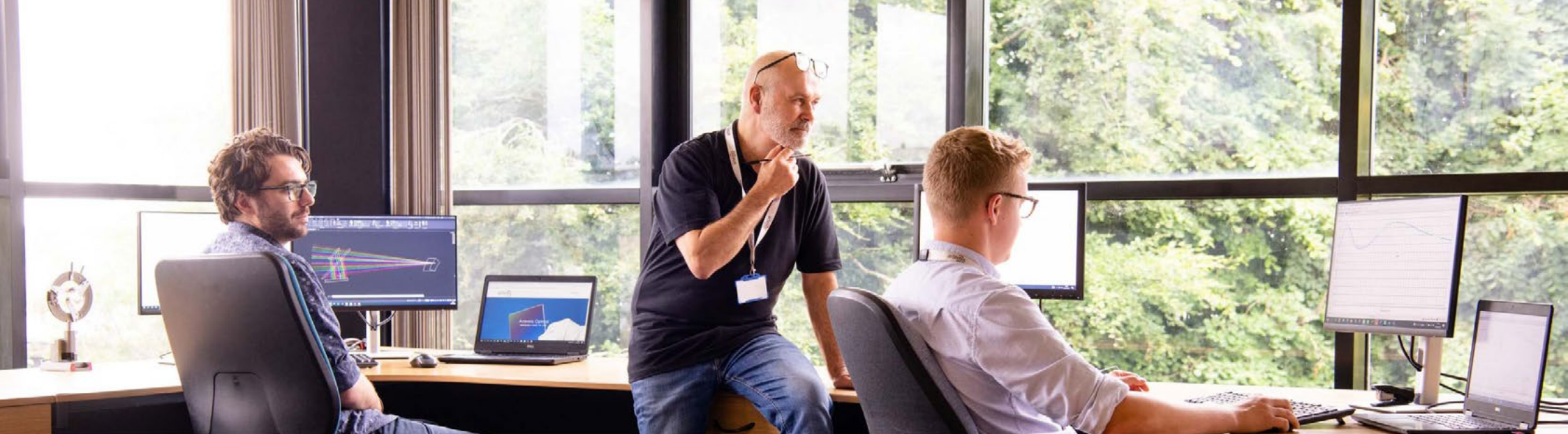
G&H | Artemis, Langleage Science Park